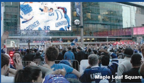
Maple Leaf Square

Want to pick up a jersey or a hat to support your favourite Toronto team? Stop by Real Sports Apparel inside The Air Canada Centre for Maple Leafs, Raptors, TFC and Marlies licensed gear. If you're a baseball fan, hit the Jays Shop at Rogers Centre.