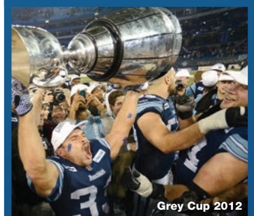
Grey Cup 2012