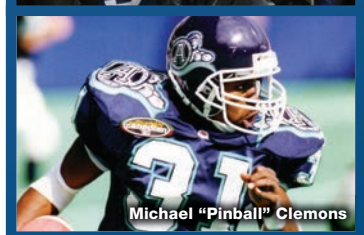
Michael "Pinball" Clemons